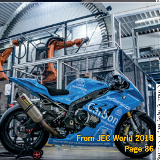
From JEC World 2018 Page 86