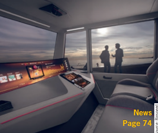
News Page 74