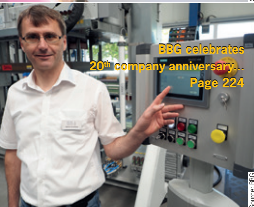
BBG celebrates 20 th company anniversary... Page 224