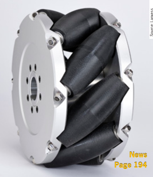
News Page 194