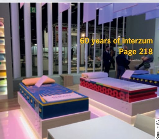
60 years of interzum Page 218